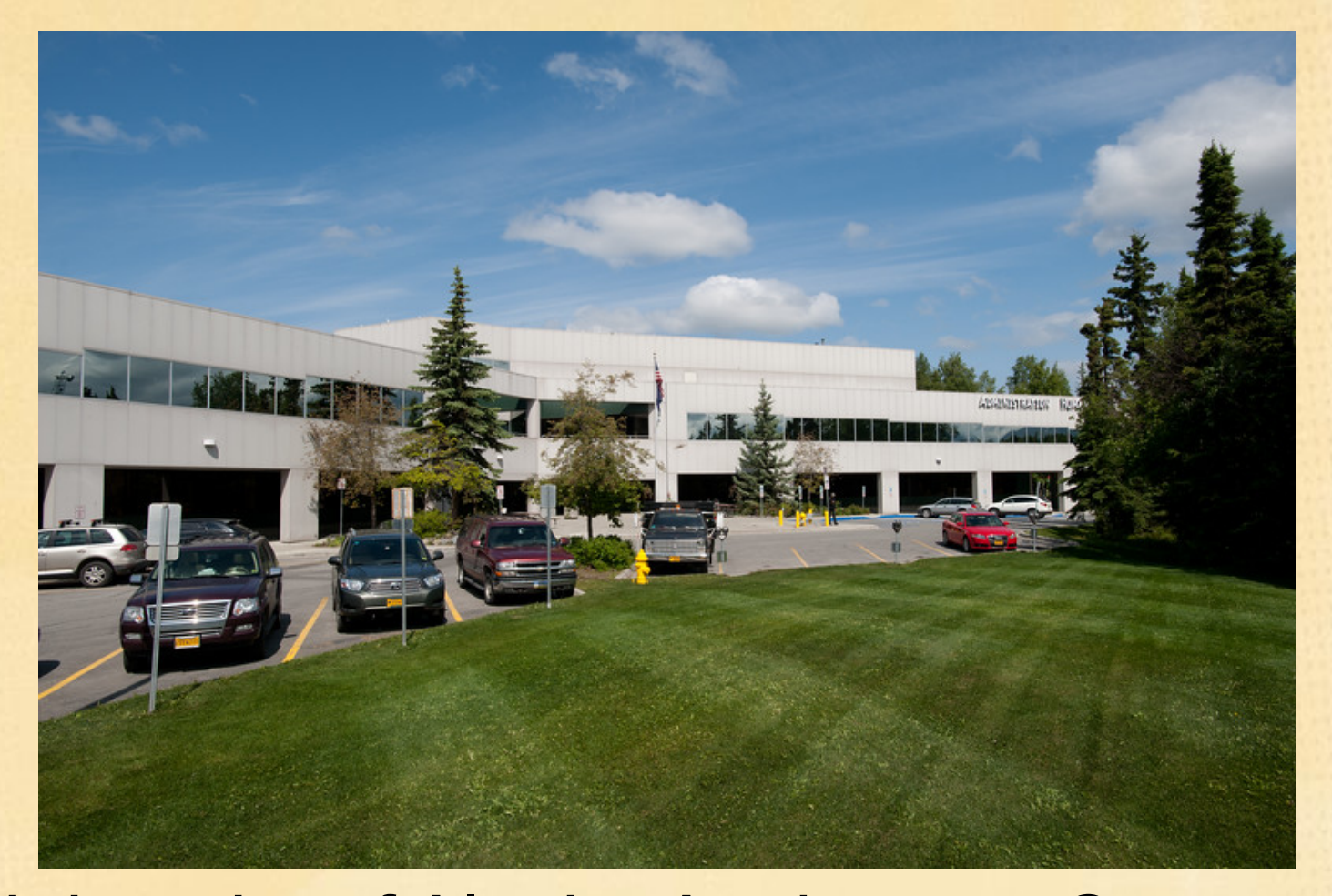
University of Alaska Anchorage Campus